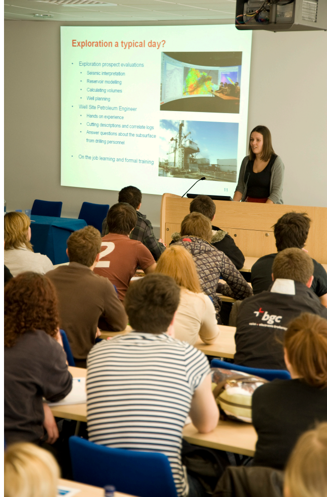
Ocean and Earth Science - a world of opportunities